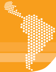
Figure 3: Fiscal Stability Regimes and Incentives in Latin American Mining (2010)